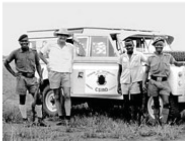
CSIRO has been conducting research in Australia and around the world since 1926.

This includes a statement on science policy from each of the political parties and a look at science workforce policy issues.